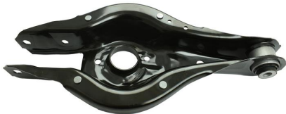
G20 M-SUSPENSION G21 TOURING STD SUSP.