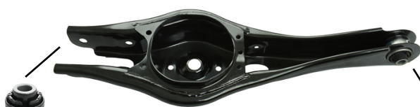
4 87051 HYBRID