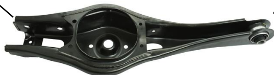
7 81678 E-NIRO ELECTRIC