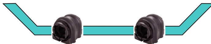
9 887902 Ø14