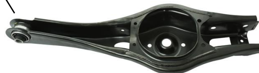
7 81678 E-NIRO ELECTRIC