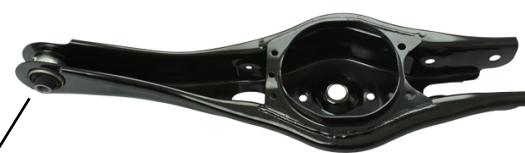
4 87051 HYBRID